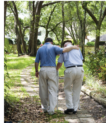
True religion is found in a life that reflects the love and character of God Himself.

The Christian church was to replace the nation of Israel. All Christians, Jew and Gentile, now comprise spiritual Israel. Israel of the Old Testament failed in its assignment to witness for God. And God gave that assignment to Christians everywhere after Jesus was here. The Bible says: “For ye are all the children of God by faith in Christ Jesus... There is neither Jew nor Greek, there is neither bond nor free, there is neither male nor female: for ye are all one in Christ Jesus. And if ye be Christ's, then are ye Abraham's seed, and heirs according to the promise.” (Galatians 3:26-29) The promises that were given to ancient Israel are now available to all of us, whether we're Jew or Gentile. If Christ has your life, you are now part of “a chosen generation, a royal priesthood, an holy nation, a peculiar people.”