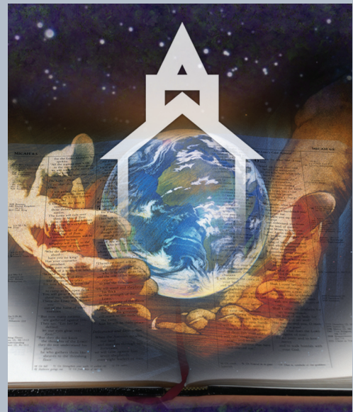
The church is God's present day Israel scattered around the world.

Now to New Testament times. Peter is writing to the New Testament church, which consisted of both Jews and non-Jews. "But ye are a chosen generation, a royal priesthood, an holy nation, a peculiar people; that ye should show forth the praises of him who hath called you out of darkness into his marvelous light." (1 Peter 2:9) A chosen people, priesthood, holy nation, peculiar people? This is language taken from God's description of ancient Israel. Only now, Peter is talking to the New Testament church, which was made up of Jews and Gentiles. What is going on here?